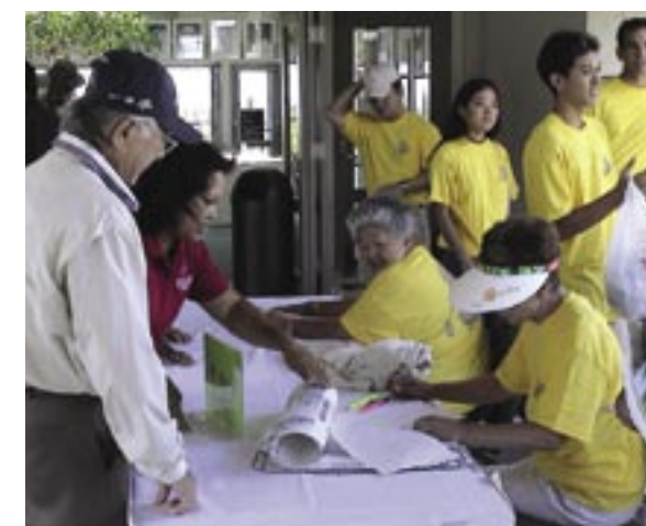
Friendly and efficient corps of volunteers check-in golfers arriving at the 2005 DSIF fundraising golf tournament.